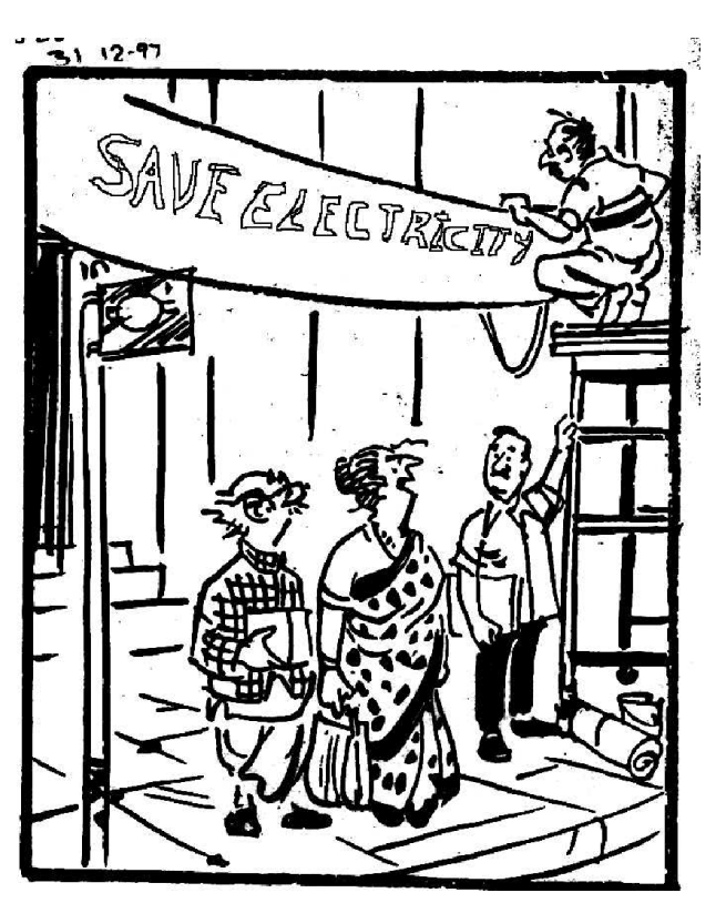
Actually we have been saving a lot of it without effort for years! We hardly get any at our place.