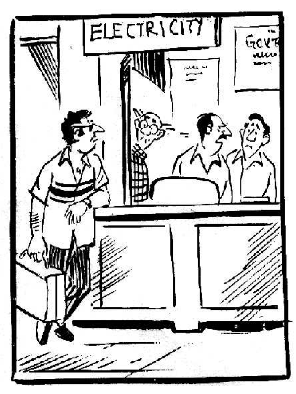
The reputation of this office is getting from bad to worse. That chap wants to know where to give the bribe!